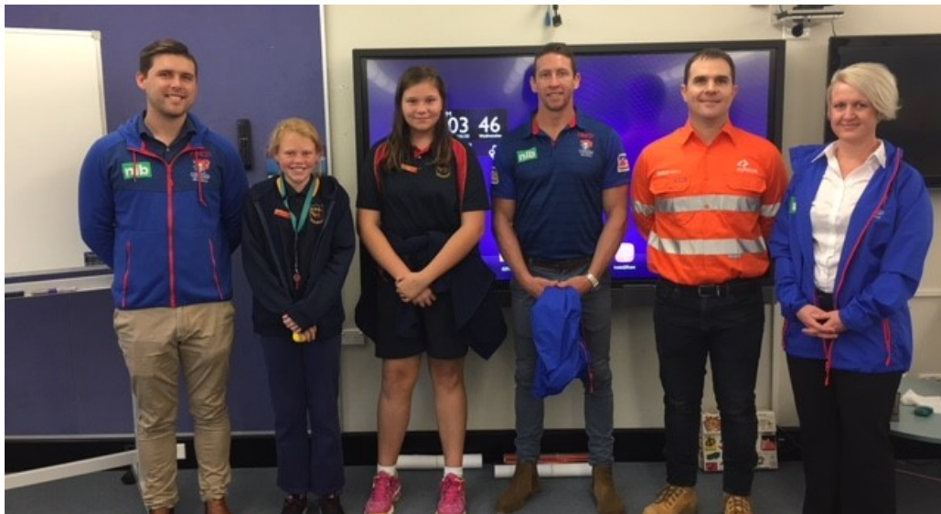
Newcastle Knights Rail Safety

On Wednesday the 20th June some Newcastle Knights came in to teach us about railway safety. They talked to us about us being safe and not to cross the rail line until the lights change. They also told that when we are at the train station, we should always stay behind the yellow line because we could fall and get hurt. They had prizes for us if we were listening and answering most of their answers. They also taught us to stop, look, listen and think. At the end of the lesson the Knights players handed out Barry, the ball and a poster about rail safety. Fassifern had a really good time. As well a big thank you to the Knights players and rail safety people.