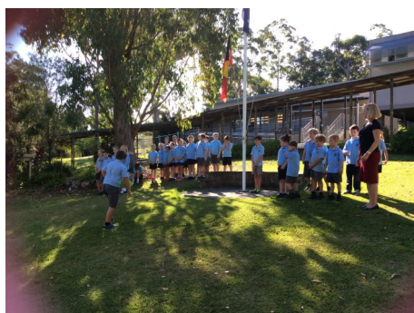
Our Anzac Ceremony 2016

Tuesdays once again is school banking day. This a great way for students to learn the art of saving. They are also able to earn rewards for their savings habit from the Commonwealth after every 10 deposits. Does not matter how much they deposit it's all about the habit.